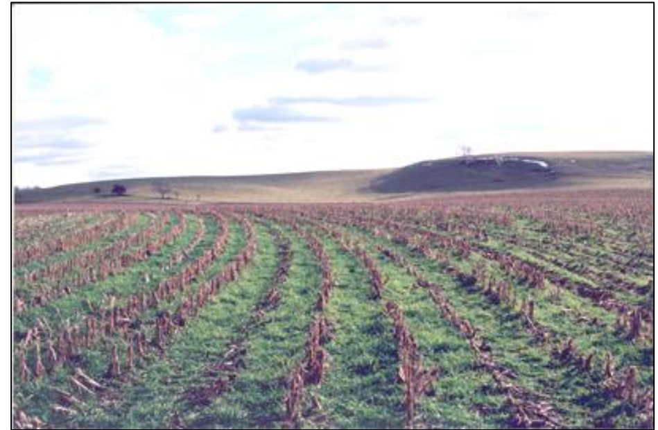
A winter rye cover crop growing in early spring, Fillmore County.

Southeastern Minnesota is a unique and sensitive landscape prone to soil erosion from production agricultural practices. Cover crops and other soil health activities minimize the damage from intense rainfall events by protecting the soil surface, increase infiltration rates and total water holding capacity , and create a more resilient system .