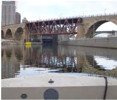
Entrance to the Upper St. Anthony Falls Lock & Dam.

After 2013 the 9 foot deep channel between mile 857.6 and mile 854 will no longer be dredged. It is anticipated that sediment will fill the channel.