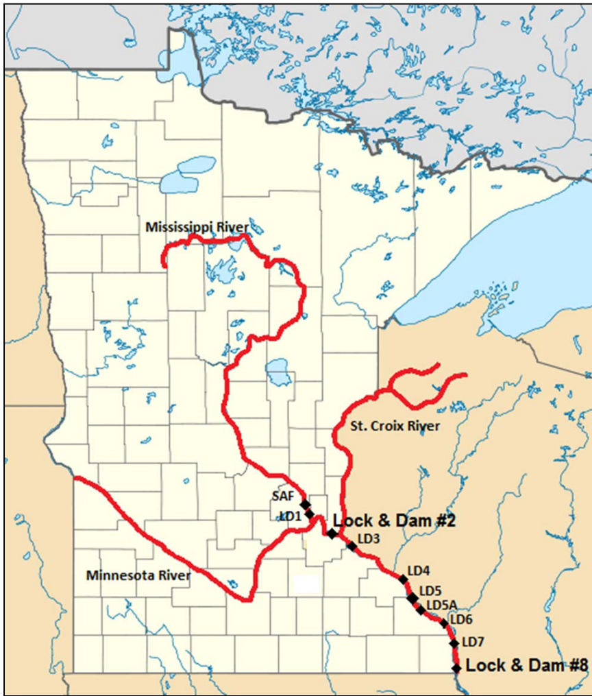
Figure 1. Map of large Minnesota rivers vulnerable to an invasion of Bigheaded carps, and dam structures that stand in the way. Presently, an electrical barrier is under evaluation for use at Lock and Dam #1 (LD #1)(St. Paul) which would only protect the Mississippi River. Optimizing Lock and Dam #2 (Hastings) through #8 (MN-IA border), through structural or operational modifications, would extend protection to nearly two-thirds of Minnesota.