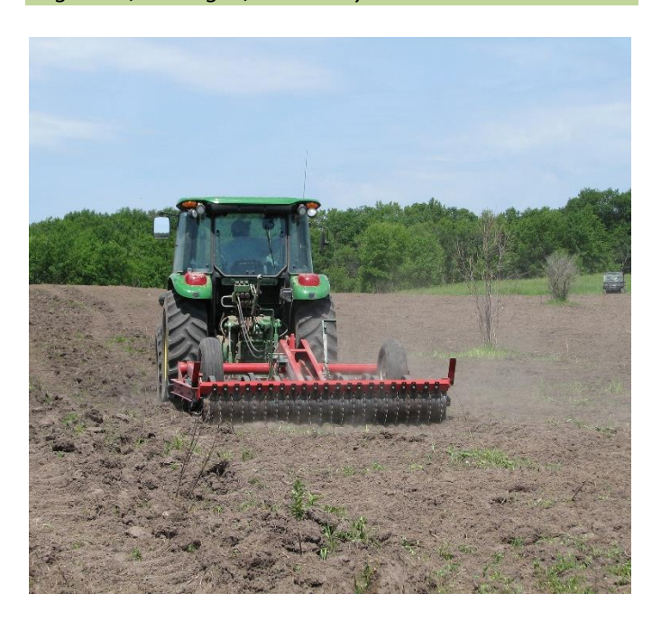
What is the Environment and Natural Resource Trust Fund (ENRTF)? ENRTF is a constitutionally dedicated fund for natural resources that originates from a combination of Minnesota State Lottery proceeds and investment income.

What is Ecological Restoration? It's the process of assisting the recovery of an ecosystem that has been degraded, damaged, or destroyed.