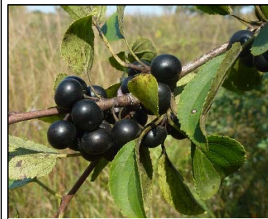
Buckthorn fruit with seed

We aim to predict the spread of buckthorn and other species based upon habitat suitability and do an economic analysis to inform decision making about priorities.