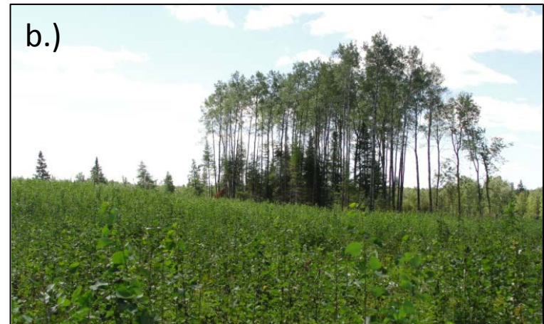
MNFRC guidelines provide two options for meeting the leave tree recommendations:

a.) scattered individual trees, or b.) clumps.