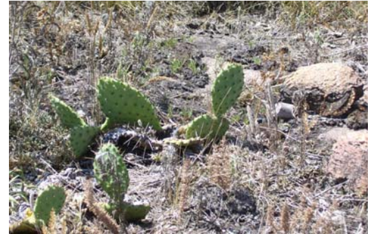
Prickly pear cacti growing on rare rock outcrop near Flora Township, Renville County, MN—LCCMR site visit, 07/11/07.