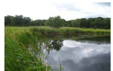
View from Pondview Trail in Sibley State Park near New London, MN—LCCMR site visit, 07/10/07.