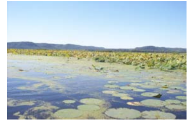
Weaver Bottoms on Mississippi River near Weaver, MN—LCCMR site visit ,09/16/08.