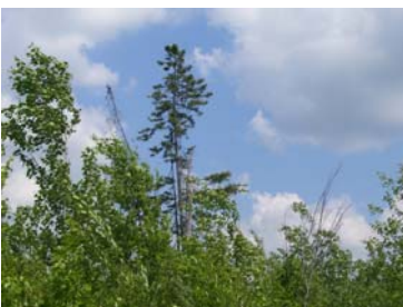
Sugar Hills Forest Legacy property near Grand Rapids, MN—LCCMR site visit, 06/13/07.

Administration: ~$1.3 million for FY 2008-2009 LCCMR administration ($1,278,000) and DNR project contract management ($73,000).