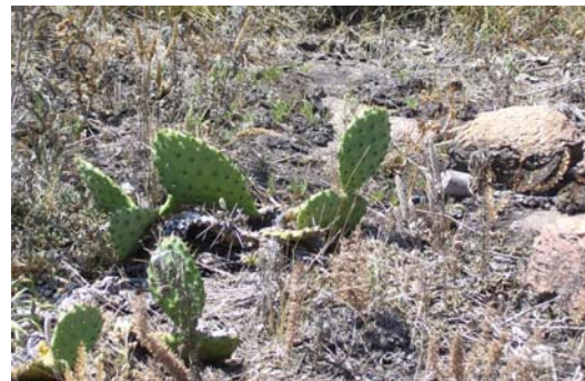
Prickly pear cacti growing on rare rock outcrop near Flora Township, Renville County, MN—LCCMR site visit, 07/11/07.